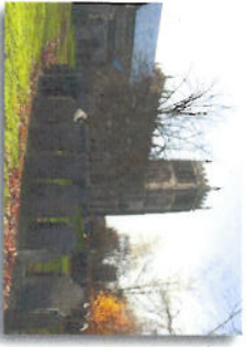
All Saint's Church